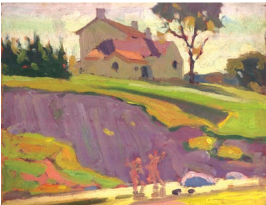
[Houses by Ravine]

8 7/8 x 10 3/4 inches. oil on board. [#296]