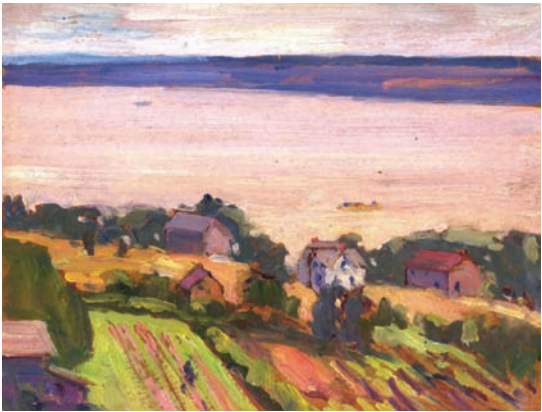
[Farms by the Lake].

8 7/8 x 10 3/4 inches. oil on board. [#299]