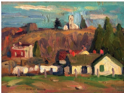
[Village with Church]

8 7/8 x 10 3/4 inches. oil on board. signed on recto. [#317].