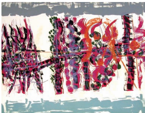
JEAN-PAUL RIOPELLE. RCA. [1923-2002]. Le couchant. 22" x 25 1/2". lithograph. Paris: Maeght Éditeur. 1979. signed, numbered "52-90" & marked "5" in pencil.