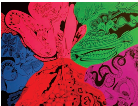
ALFRED PELLAN. RCA. [1906-1988]. Bestiaire. 26" x 34 1/4". lithograph. signed, titled, numbered "E/A 6/15", & dated 1974 in pencil.