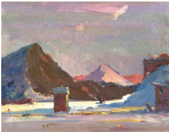
[Gravel Works in Winter]. 9" x 10 3/4". oil on board. [#267]