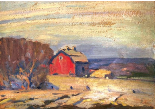
[Barn in Winter].

8 1/2" x 10 1/2". oil on board. signed on recto. [#259].