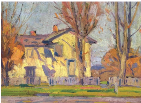
[House in Sunlight]. 8 1/2" x 10 1/2". oil on board. [#258]