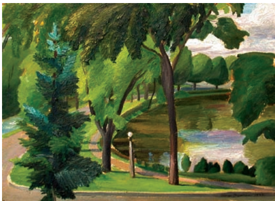
Brown's Inlet, Ottawa. 1947.

25" x 20". oil on masonite. signed, titled & dated.