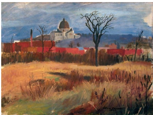
Shrine on Mountain. 1943.

13¼" x 16½". oil on masonite. signed, titled, dated, & inscribed.