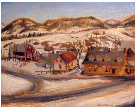
The Inn, Piedmont Quebec. 1940

13¼" x 16½". oil on masonite. signed, titled, dated, & inscribed.