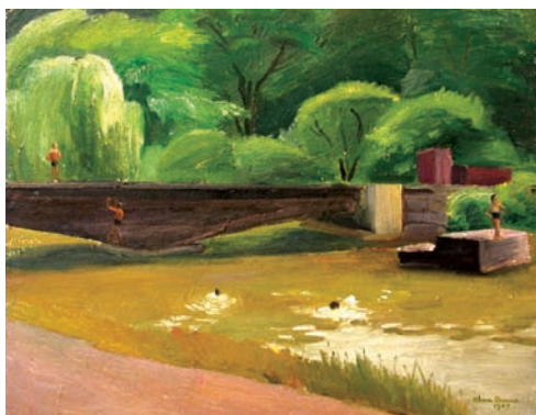
[Boys Swimming in River]. 1947.

20" x 25". oil on masonite. signed, titled, & dated.